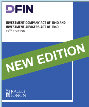
Investment Company Act of 1940 and Investment Advisers Act of 1940, 27th Edition