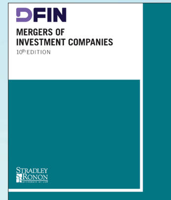
Mergers of Investment Companies, 10th Edition