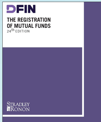
The Registration of Mutual Funds, 24th Edition