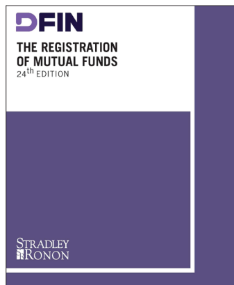
The Registration of Mutual Funds, 24th Edition