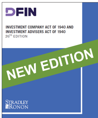
Investment Company Act of 1940 and Investment Advisers Act of 1940, 26th Edition

(Click on the book you're interested in downloading.)